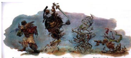
Common Shrapnyl Guttersnipe Tatteredmound